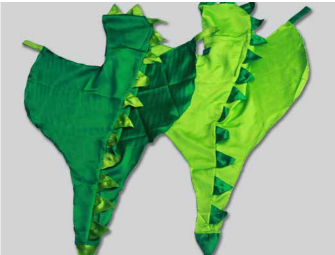
Dinosaur ONE SIZE 3-5 Simple satin dinosaur $27