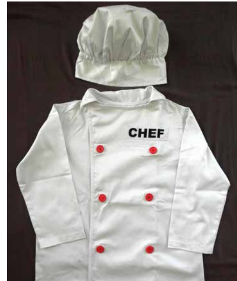
Chef with Hat ONE SIZE 3-6 YRS Jacket and hat made of tough cotton drill fabric with velcro fastening $35