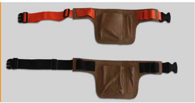
Builder Belt ONE SIZE Fake leather, lined pocket and adjustable belt strap $25