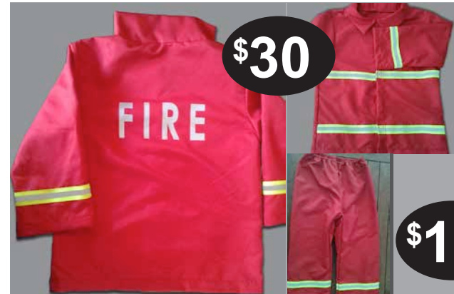
Fireman Jacket ONE SIZE Micro fibre easy to wear fabric. Pants Optional $10