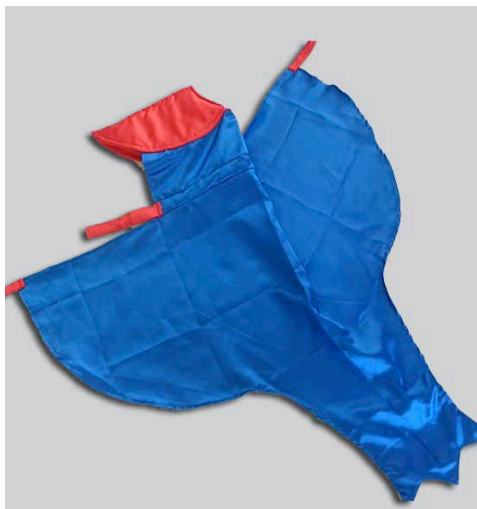
Pukeko ONE SIZE 3-5 YRS Simple satin stylized bird $25