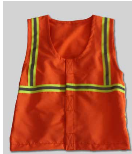
Work Vest ONE SIZE Strong fabric with velcro opening on front $23