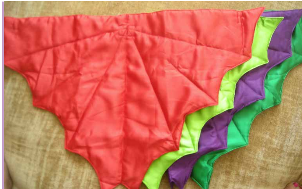
Wings ONE SIZE > Red > Light green > emerald green > Purple Padded wings with elasticated shoulder straps and wrist bands $27