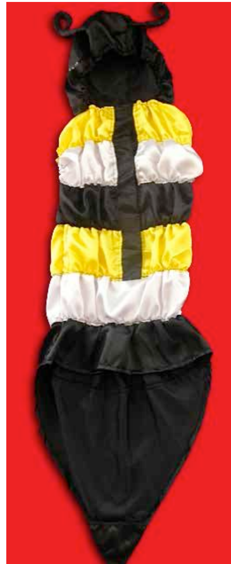
Caterpillar ONE SIZE 3-5 YRS Satin with velcro opening on front $30