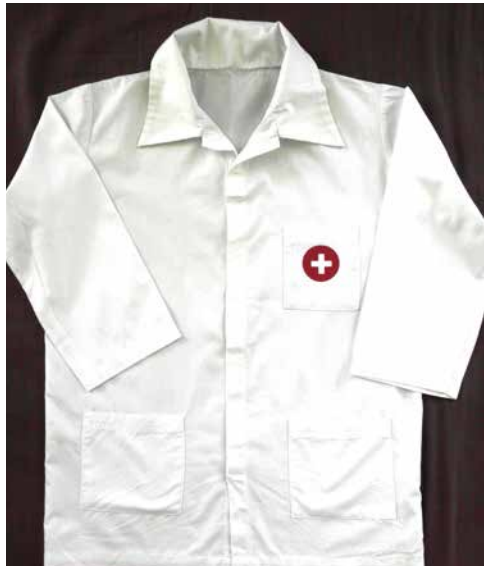
Doctor's Coat ONE SIZE 3-5 YRS Strong cotton with velcro fastening $30