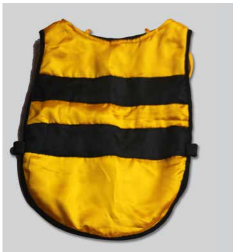
Uni Bee ONE SIZE Padded vest with wire bee wings on back $30