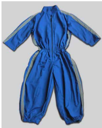
Overalls M, L > Blue with silver stripe Tough clothing for the mechanic, racecar driver etc $45