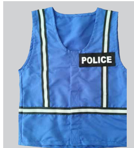
Police vest ONE SIZE 3-5 YRS Strong fabric with velcro fastening $23