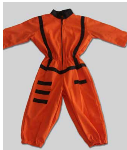
Astronaut M, L > Orange with black stripes Tough fabric and zips for the explorer $45