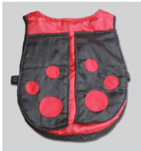
Uni Bug ONE SIZE Padded vest with padded wings on back $30